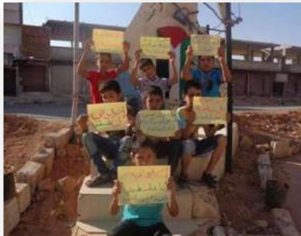
The solidarity vigil in Khan Al Shieh camp

The children raised banners condemning the continued crimes of child abuse "and called the international community to act quickly to put an end to violations of Zionism against the Palestinian people.