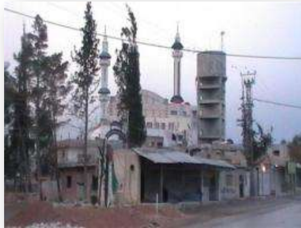
Khan Al Sheih camp

The roads closure has reflected negatively on the availability of necessary food supplies, as many kinds of it were ran out and the prices of other kinds has raised.