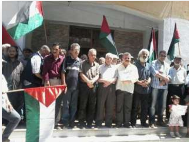
The protest in the Yarmouk camp

At the Yarmouk camp south of Damascus, separate areas of the camp were targeted with shells which only led to material damages. The organizations and institutions inside the camp carried out a protest the day before in the occasion of the third anniversary for the siege that is imposed on the camp by the Regular Army and the Palestinian affiliated factions, where the protestors demanded to stop fire , open the road to the camp to enter the food aid and returning back the water , power and infrastructure services. The protestors also expressed their solidarity with the displaced Palestinians of Syria in Lebanon who are suffering of severe living situation. They also suffer of the UNRWA reduced services and the mistreatment by the Lebanese security authorities with the Palestinians of Syria file.