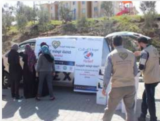
Distributing food aids in south of Turkey

In Turkey, the Palestinians of Syria Committee in Turkey distributed some of food aids provided from Al Wafaa European Campaign on a number of Palestinian families in Osmaniye city south of Turkey. It is mentioned that the number of the Palestinians of Syria refugees who escaped the war in Syria is from 3000 to 5000 refugees, most of them entered the Turkish territories using irregular ways due to the rejection of the Turkish Embassy in Lebanon to give them visas to enter Turkey.