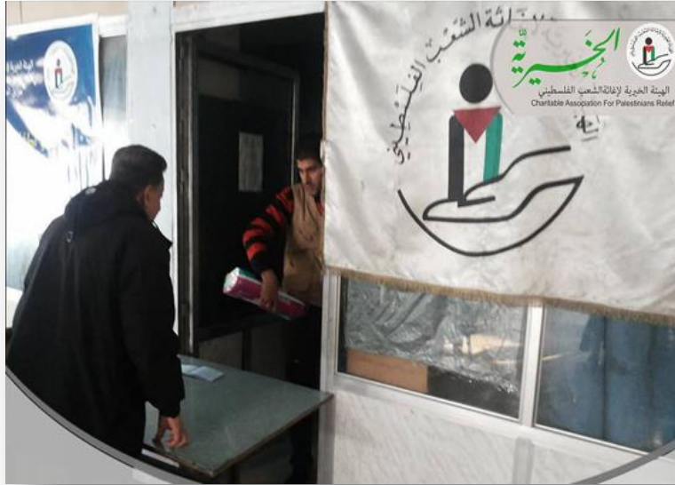
Aid distribution Qudsaya town

the economic burdens of the Palestinian families who were displaced from their camps to Qudseia.