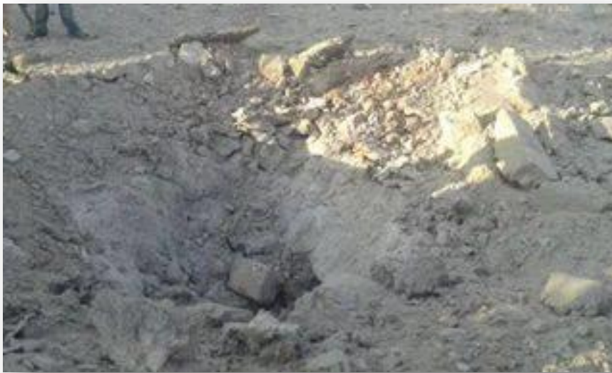
Bombing targeted the vicinity of Khan Al Sheih camp

Bombing with explosive barrels targeted the vicinity of Khan Al Sheih camp in Damascus suburb and targeted the adjacent farms which led to a state of anxious, while the roads that link the camp with the city center are still closed except for Zakia- Khan Al Sheih. In terms of living aspect, the residents are still suffering of securing food supplies and fuels which are rare in the markets.