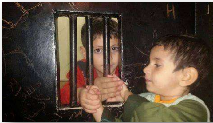
Children detained in Karmouz prison in Egypt

This comes after Palestinian and Syrian refugees, who are detained at Karmouz prison in Alexandria Egypt, declared their open hunger strike starting from yesterday 9th of Feb.2014 till they achieve their demands that are to immediately coordinate with the concerned parties for receiving them in the European countries, which their families are in,. The strike also comes as a response to the carelessness of the International and humanitarian organizations toward their case after passing 100 days in the detention prison. It is mentioned that they are treated as prisoners and so far from the humanitarian treatment.