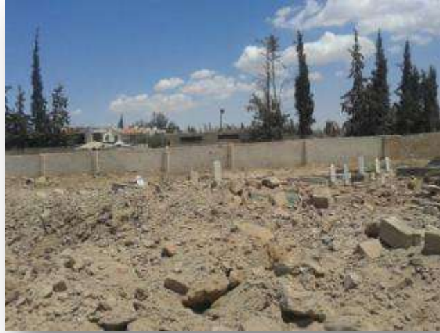
The effect of shelling on the cemetery in Khan Sheih camp