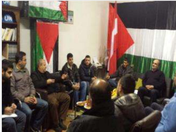
Palestinians of Syria meeting in Austria

These procedures and difficulties prompted one of the Palestinian refugees from Syria in Austria, on 2nd of December 2014, to undress and stand naked, in spite of the low temperature in Austria, where he said that he did so in an attempt to draw attention and to protest against delayed reunion procedures in Europe. He posted on his Facebook, "I took off my clothes in the cold because of the injustice done to me and to the Palestinian and the Syrian refugees in Austria and all of Europe, we left our children in displacement camps in Syria, Jordan and Turkey, in a new Palestinian immigration, and fled from the conflict in Syria in order to protect our children, therefore, I call on quickening the reunion of all refugee's families."