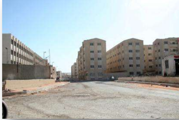
Al Husseneia camp

refugee camp and forget the rest of the Palestinian refugee camps; such as Daraa, Handarat, Husseneia, and Khan Al Shieh camp. Therefore the activists demanded the PLO, the UNRWA, and the Palestinian factions to work seriously and to intervene in order to neutralize all Palestinian refugee camps in Syria and make it safe areas.