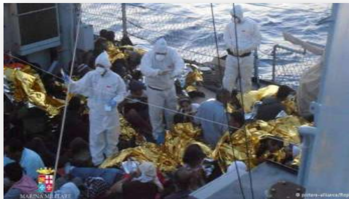
The Italian Navy teams

The Italian Navy teams rescued 130 people who were on board of a boat that was launched from Libya heading towards the Italian territory, and the work is still going on to reach the rest of them off the island of Lampedusa, south of Italy and they were estimated as 1000 immigrants of different nationalities, including hundreds of Palestinian and Syrian refugees, who were launched from Libyan cities "Zliten, Zuwarah, and Sabratha" heading towards the Italian territory, while some reports said the teams rescued all immigrants.