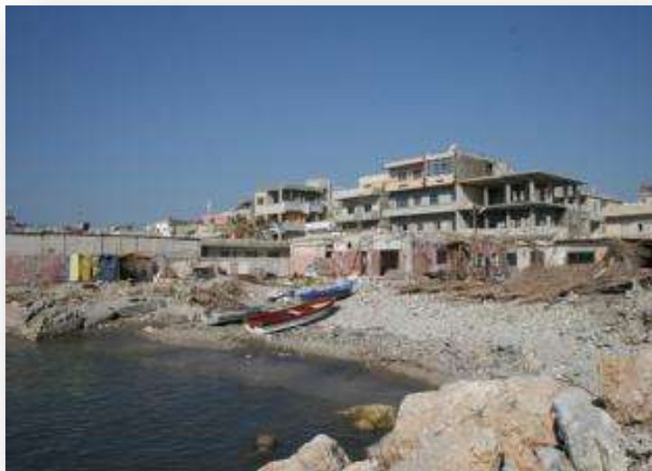
Al Raml camp in lathakia

In the same context, the people of Al Raml camp in lathakia live in a state of calm amid continued economic suffering, where residents complain of high prices of food materials, in addition to the high cost of rent houses. It is referred that the camp receives a number of displaced Palestinian refugee from camps and neighboring regions.