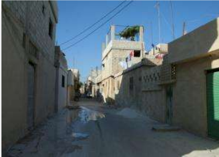
Khan Dannoun Camp.

In Syria, clashes and shelling has renewed and targeted Al Tiba town adjacent to Khan Dannoun Camp in Damascus city. These clashes was between the Syrian regular army and groups of the Syrian armed opposition, which led to the continuation of the state of tension in the ranks of the people for fear of their camp might enter in the clashes circle. In Damascus, the "UNRWA" resumed food aid distribution to the people of the trapped Yarmouk Camp by the regular army roadblocks and groups of the PFGC. Meanwhile, the water cuts continue for 54 days respectively