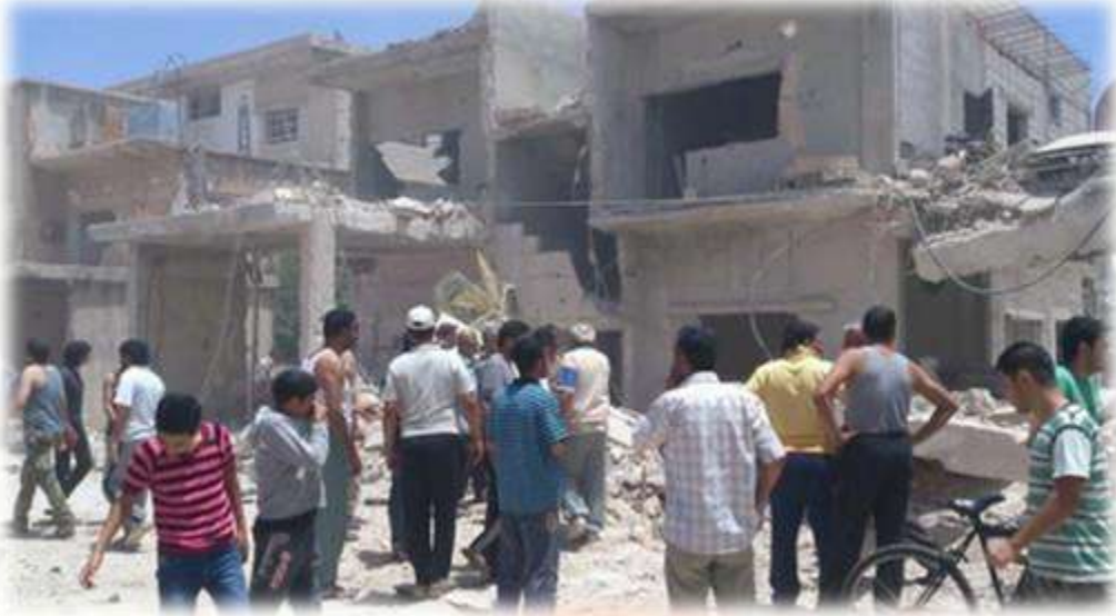
Bombardment with explosive barrels targeted Khan Al Sheih camp

“Warplanes Target Khan Al Sheih Camp with Explosive Barrels, Causing One Victim, a Number of Injuries and a Massive Destruction to Civilian Homes”