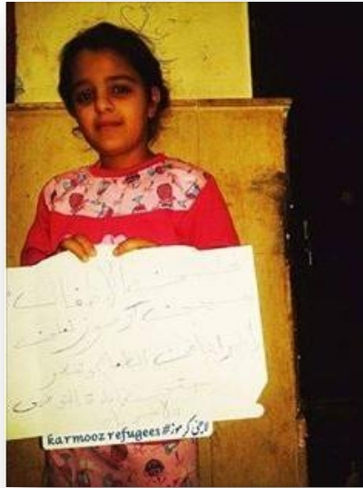
One of the detainees in Karmouz prison

It should be noted that the Egyptian authorities have arrested "56" Palestinian refugees from Syria while trying to reach Italy from the Turkish beaches in 25th of January 2015.