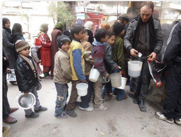
The food distributed to the people in the camp

This comes in light of the continued prevention of entering all food supplies, including the urgent relief aid, which were entered by UNRWA and a number of private organizations once in a while.