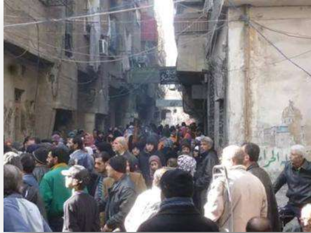
Yarmouk residents gathered hoping to receive food aids

Meanwhile, hundreds of residents gathered and waited for many hours hoping to receive urgent food aids which was supposed to be distributed and which were suspended for about 6 weeks, amid recriminations between the conflict parties of assuming the responsibility of clashes that led to the suspension of distributing the aids.