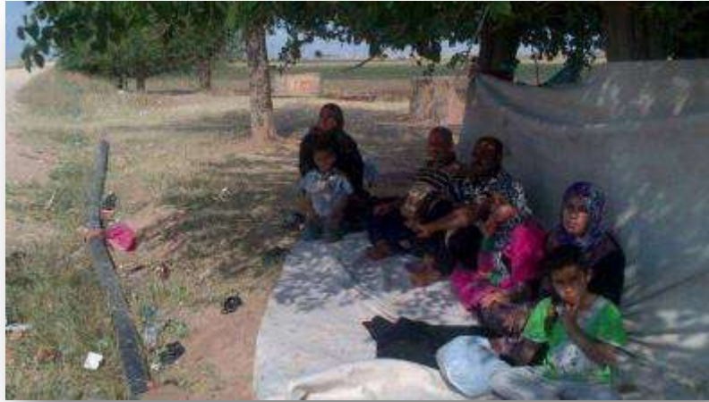
Palestinian _ Syrian families on the Turkish side of the Syrian-Turkish border

It is noteworthy that Turkey imposed visas on Palestinians Syrian refugees and that such visas have been stalled for more than a year without showing any details about the reason for stopping .