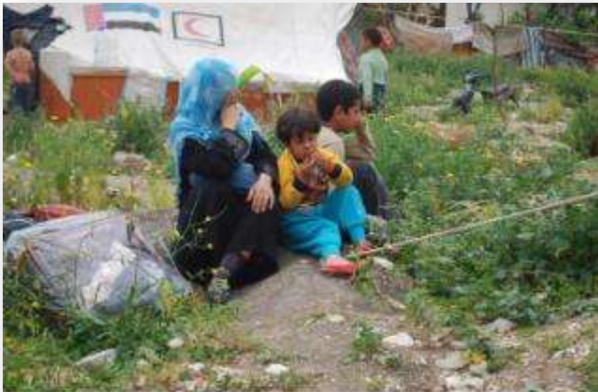
Refugee camp in Lebanon

On the other hand, the Lebanese authorities continue to take decisions that will tighten on Palestinian and Syrian refugees from Syria, where some municipalities have taken decisions limiting residents' refugee movement. Some of these decisions prevented roaming after seven o'clock pm, as some others banned the Lebanese landlords to rent their homes for more than a family coming from Syria. It is mentioned that the Lebanese authorities have taken decisions that limit the entry of refugees from Syria to Lebanon.