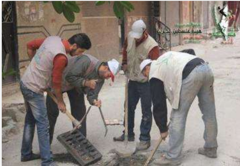
Cleaning sewage emollients in the Yarmouk Camp

In Lebanon, Palestinian doctors of Syria in Lebanon gathering has established a medical lecture titled "Winter Illnesses and Prevention" in the shelters at Ain Al Hilwa Camp. The lecture dealt with the most important diseases that occur in the winter, especially in places of human populations - as in shelters - because of overcrowding, and most important is the Respiratory diseases, especially inflammation of the pharynx, colds and inflammation of the middle ear and lung infections and bronchitis, asthma. The lecture also touched on how to deal with these diseases and the ways of prevention it, through some tips and recommendations.