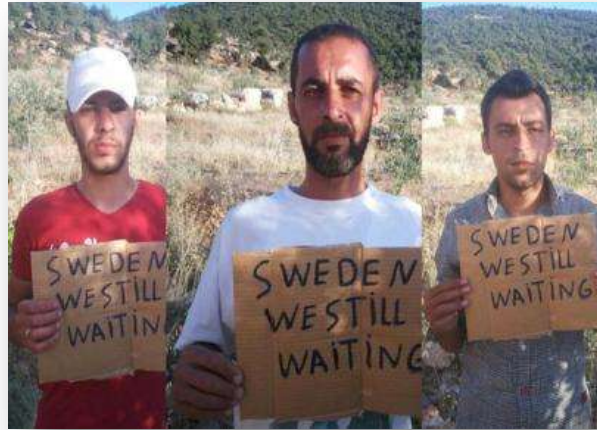
The three young men trapped on the border

الأخبار/620-العالقون-على-الحدود- http://www.actionpal.org/index.php/ Dيستصرخون-الض%25