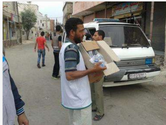
Providing refreshment to high school students before heading to exams

The Palestine charity commission, in Khan Al Sheih refugee camp, provides hospitality for high school students, before heading to their exams, in Zakia town, out of moral support and tries to mitigate them