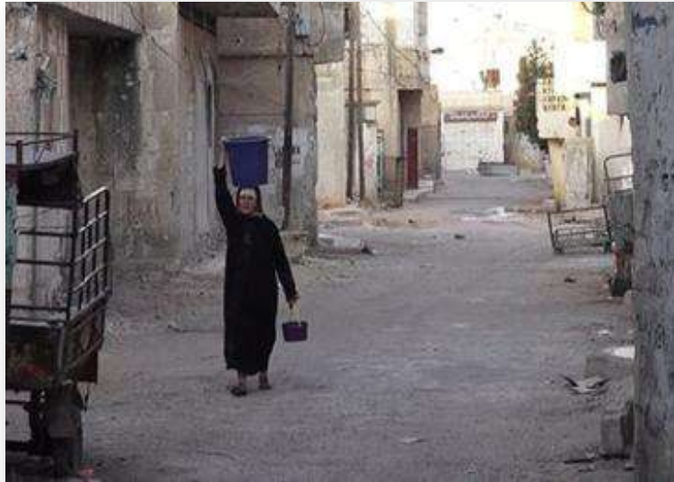
Water Crises in Dara'a Camp